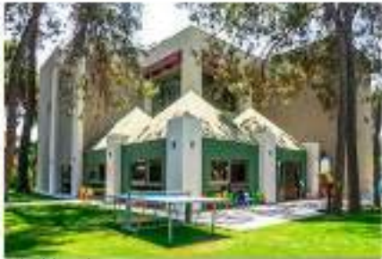
Kids Club Garden

Kids club (4-11 ages), Junior Club only in high season (12-16 age), TV , Playstation, kids toilet, aquapark with 7 water slides and open children playground. Mini Club is located near by the Aqua Snack Restaurant.