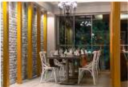
Mexican A La Carte

*Restaurant and bar operating hours or days may change due to adverse weather conditions, technical reasons and guest requests.