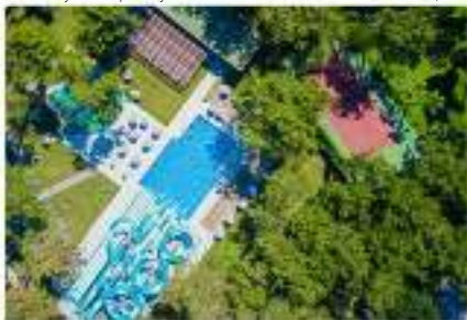
Aqua Park Pool

Pools may be temporarily closed due to adverse weather conditions, safety and pool hygiene