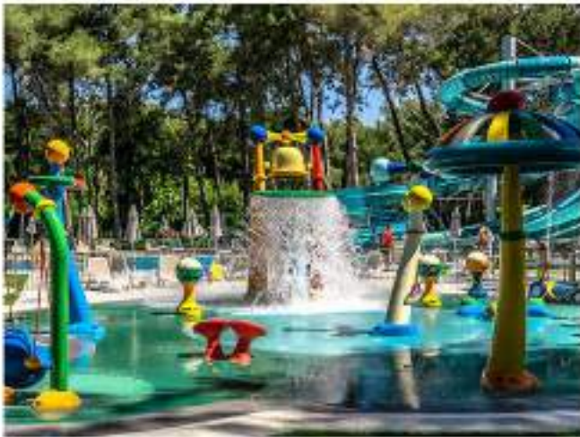
Aqua Park Splash Zone