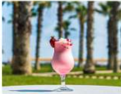
Passion Cocktail Bar