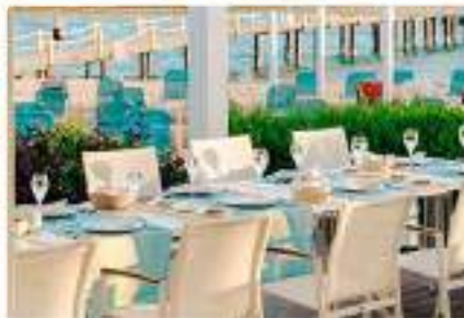
Turkish A La Carte