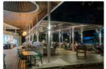
Far East A La Carte