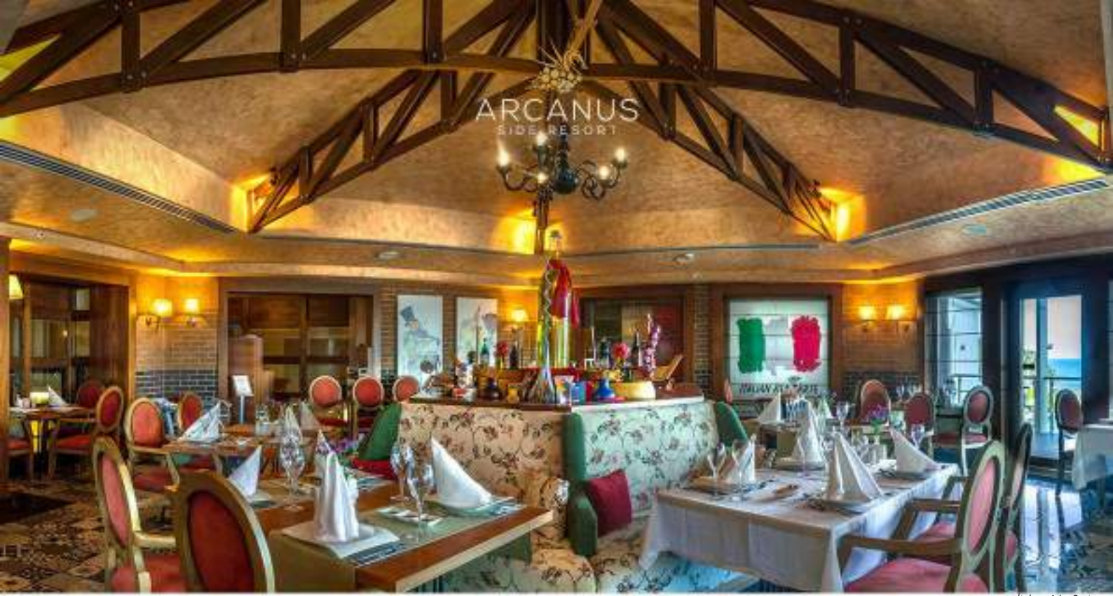
Italian A La Carte