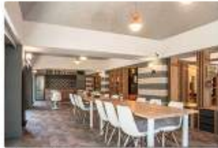
Wide interior design